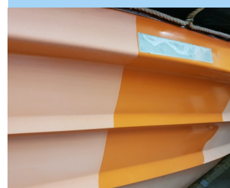
Right side after treatment. Only pre-clean with Careclean Multiclean solution was done.